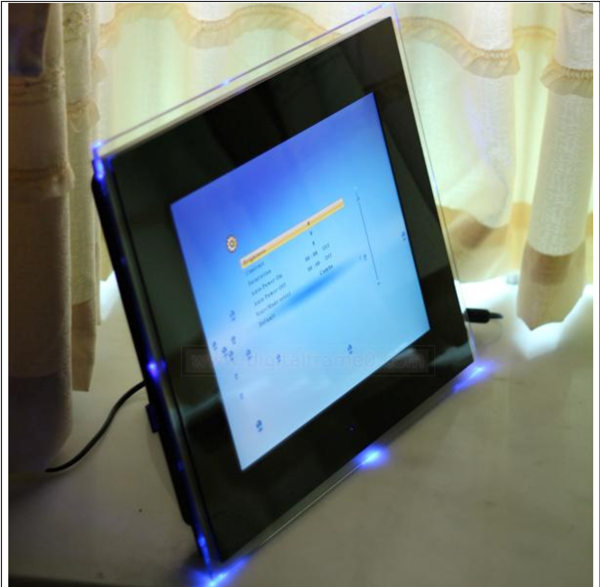
DPF12Hb / DPF15Hb