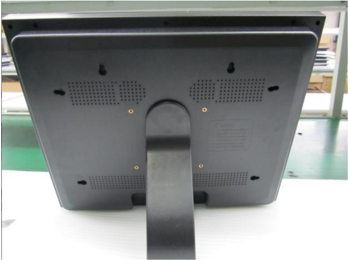
The back with 4 VESA holes ( 15"~19")